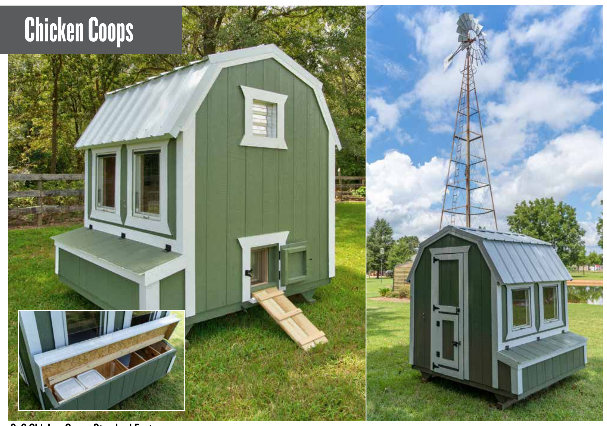
6x6 Chicken Coops Standard Features = Painted or Stained Siding = Metal Roof = FRP Flooring on Interior Room = Insulated Roof = 2 windows

■ Ground Contact Treated Skids ■ Water System ■ Fold up roost ■ Clean-out Door ■ Vent Door