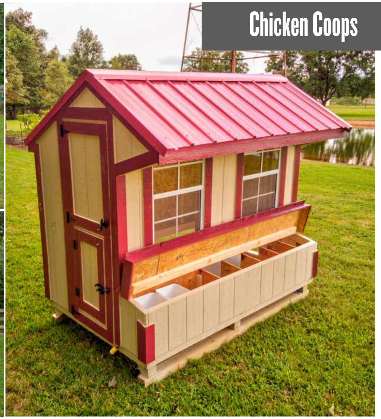
5x8 Chicken Coops Standard Features = Painted or Stained Siding = Metal Roof = FRP Flooring on Interior Room = Insulated Roof = 2 windows = Ground Contact Treated Skids = Water System = Fold up roost = Clean-out Door = Vent Door