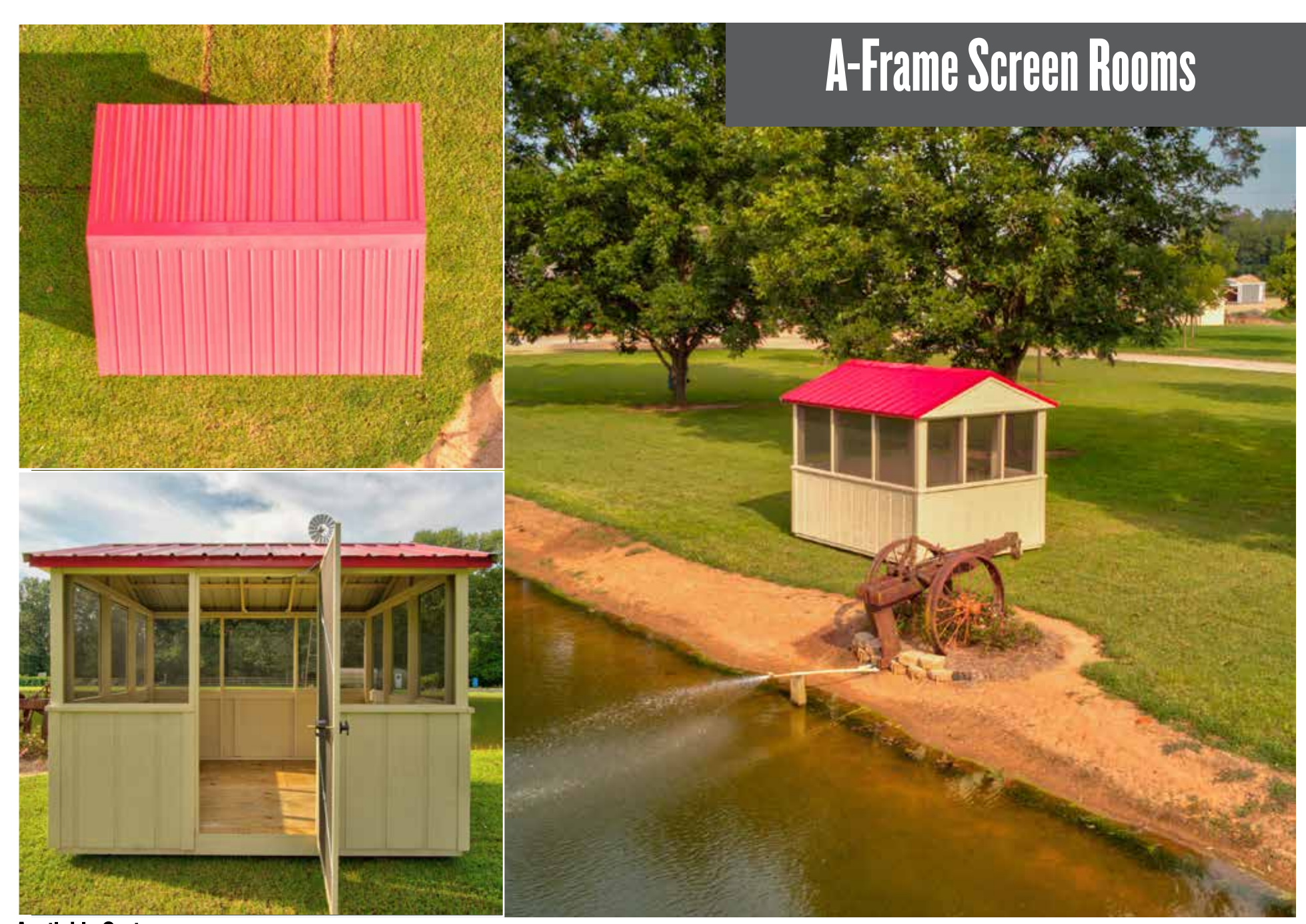
Available Options = 5' Swing = Heat Shield = 1/2 Benches = Composite Floor = Glider Swing = Table = Painted