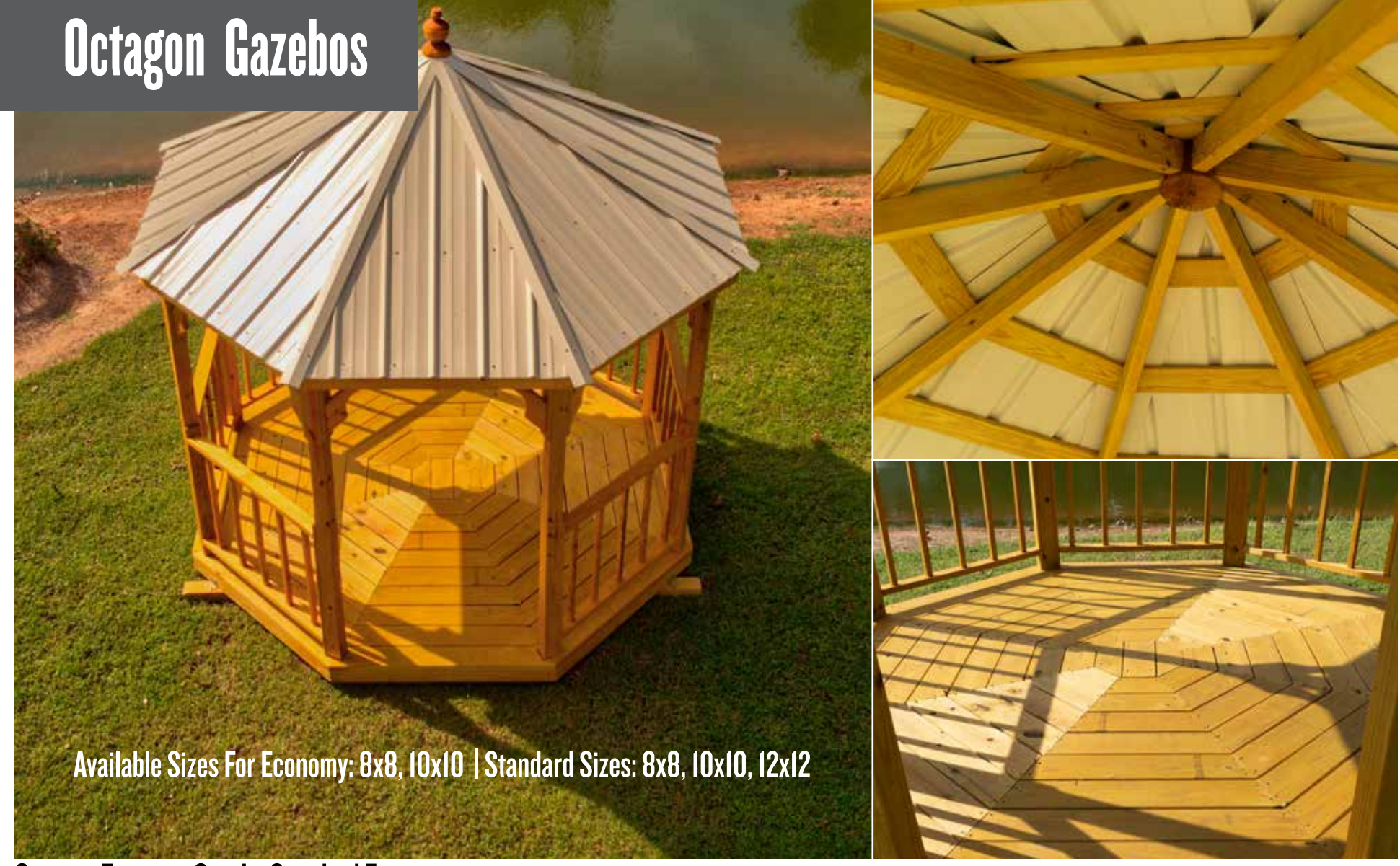
Octagon Economy Gazebo Standard Features - Metal Roof - #I Pressure Treated Yellow Pine Lumber with Sprayed on Stain - Radius Edge 2x4 Flooring

■ Rust Resisting Fasteners ■ Ground Contact Treated Skids