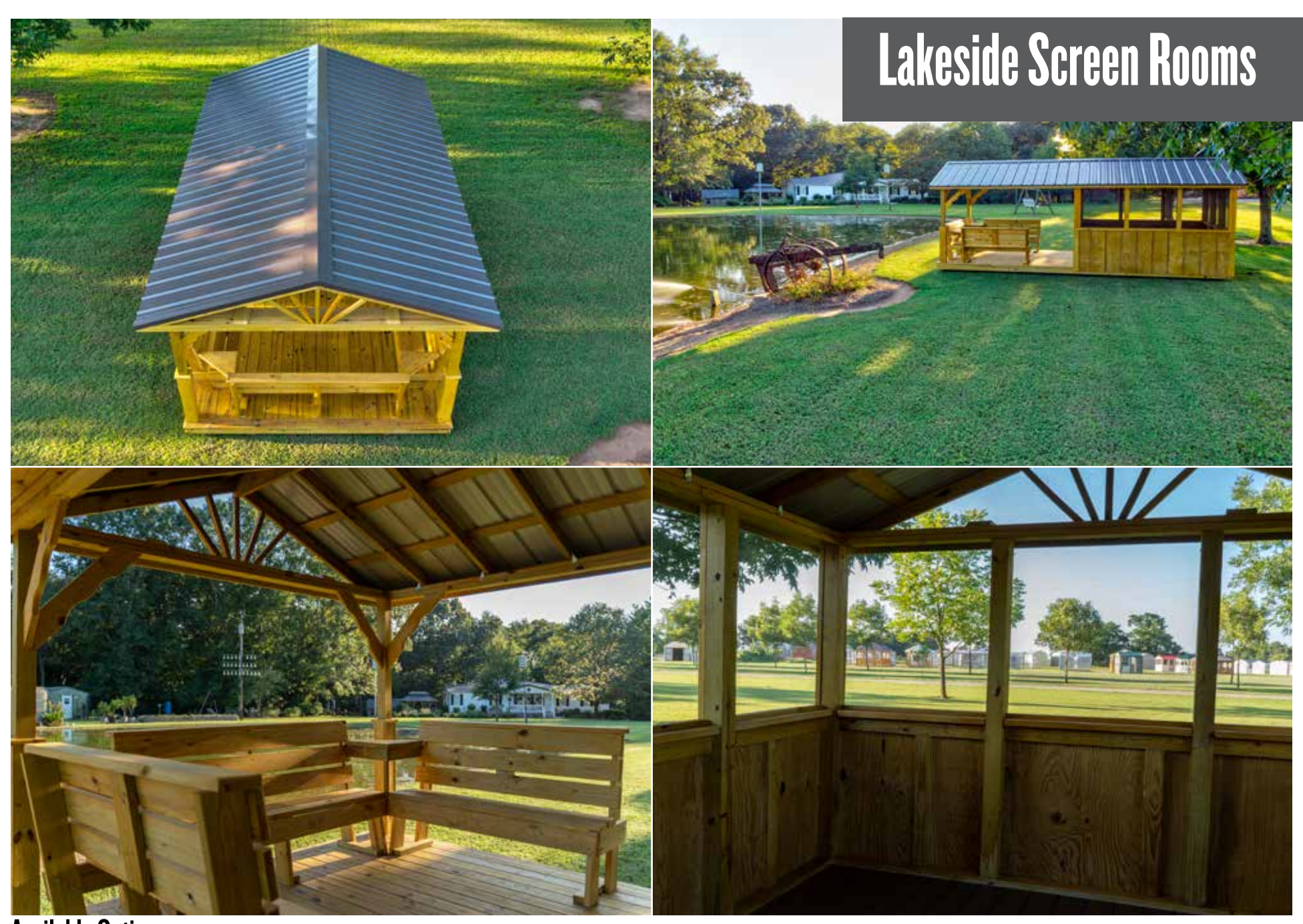
Available Options - 5' Swing - Glider Swing - Heat Shield - Composite Floor on Interior room