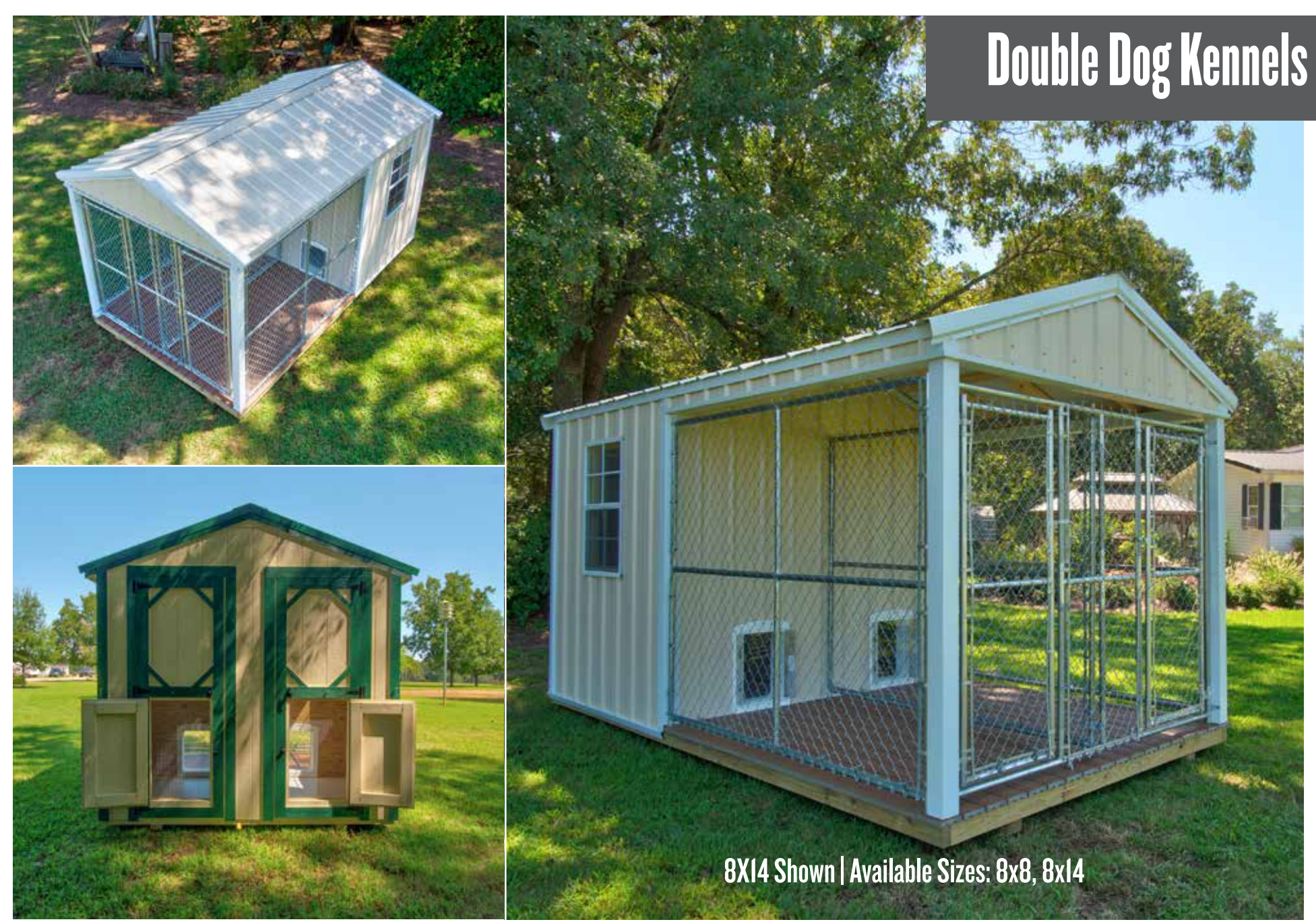
Double Dog Kennel Standard Features = Painted or Stained or Metal Siding = Metal Roof = Concealed Fasteners on Composite Flooring = Insulated Roof = 2 Windows = Dog Door = Composite Flooring in Chain Link Area = Wire Protection on Windows = All Welded Hinges on Chain Link Doors = Ground Contact Treated Skids = FRP Floor on Interior Room