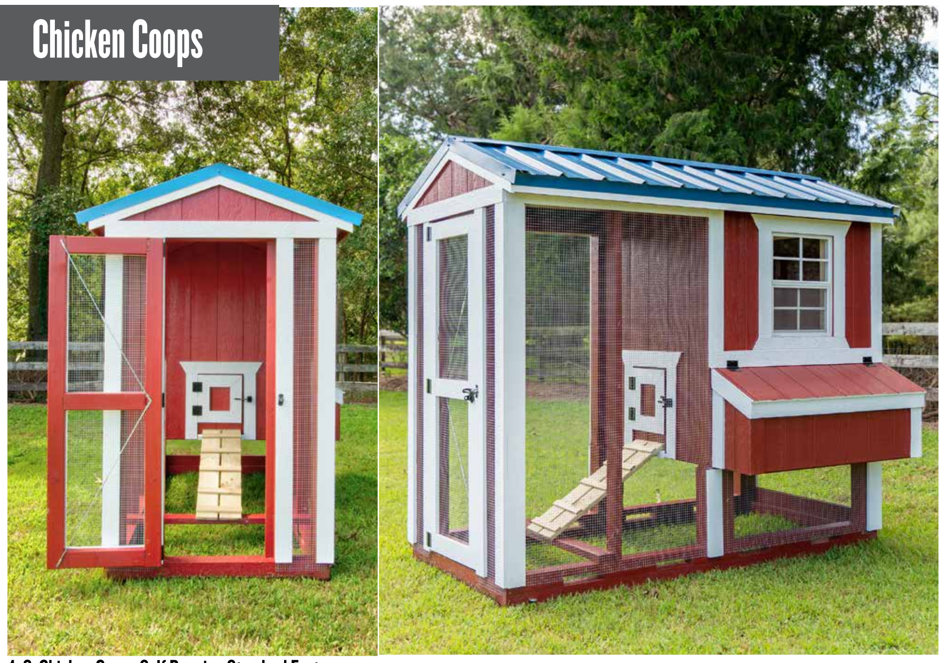
4x8 Chicken Coops Self Ranging Standard Features = Painted or Stained Siding = Metal Roof = FRP Flooring on Interior Room = Insulated Roof = 2 windows