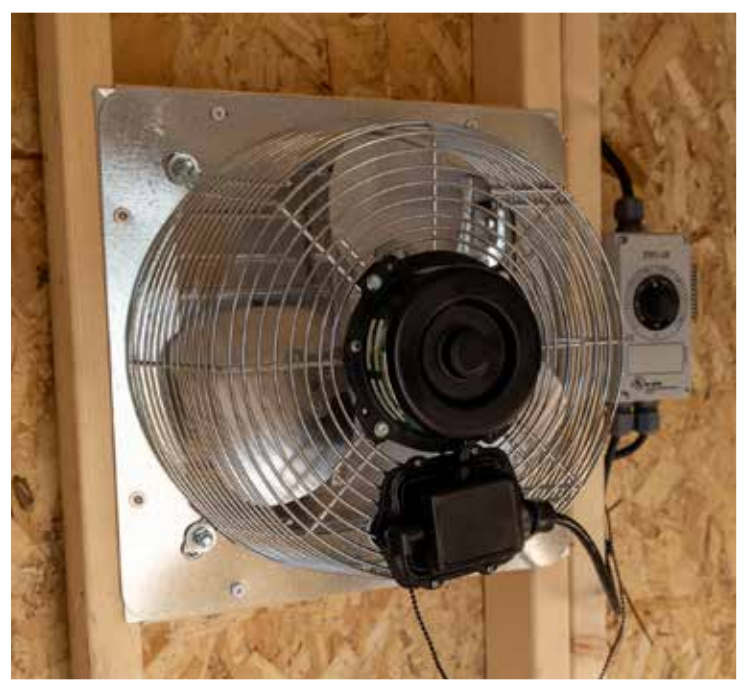
Louvered Fan w/ Power Shutter & Thermostat