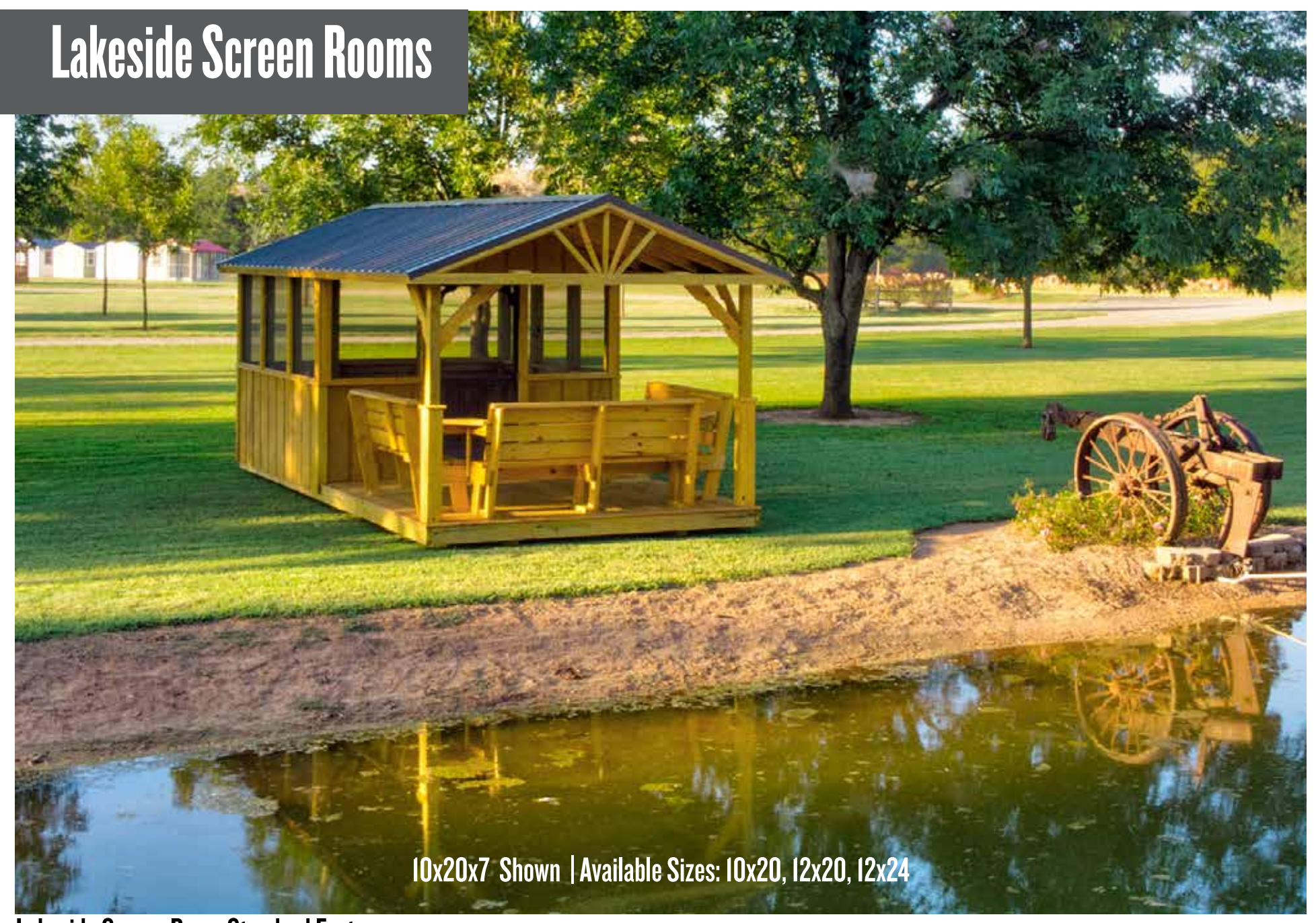
Lakeside Screen Room Standard Features - Treated Siding w/Sprayed on Stain - Metal Roof - Ground Contact Treated Skids - One Aluminum Screen Door