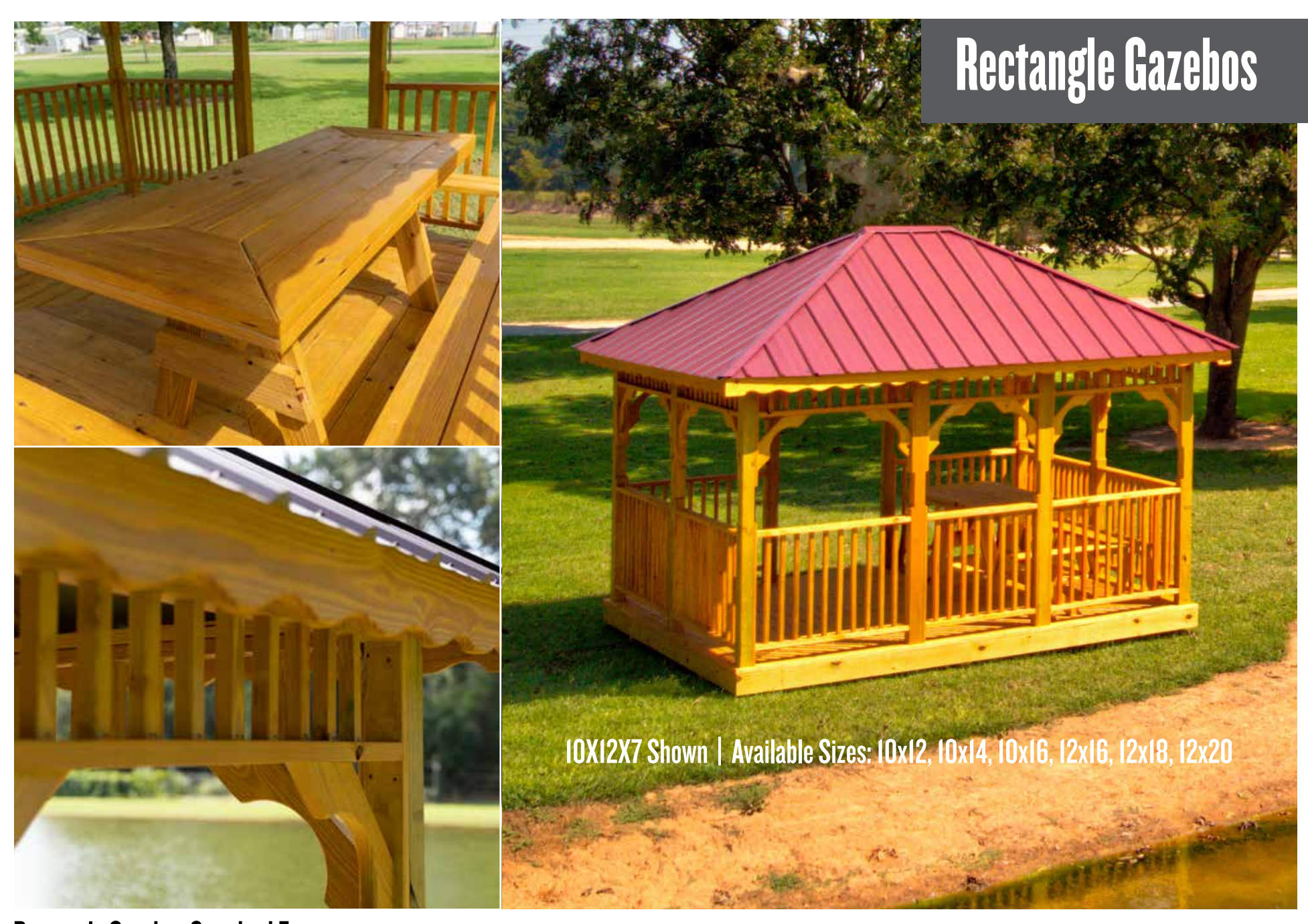
Rectangle Gazebos Standard Features = Metal Roof = #I Pressure Treated Yellow Pine Lumber with Sprayed on Stain = Radius Edge 2x6 Flooring = Rust Resisting Fasteners

■ Scalloped Fascia ■ Ground Contact Treated Skids