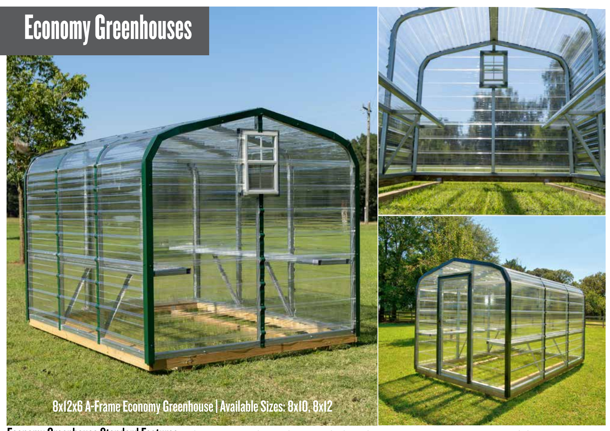
Economy Greenhouse Standard Features - Choice of Metal Trim Color - One Door - 2x4 Ground Contact Treated Wood Bottom Perimeter - Two 16" Shelves Available Options - Window, Closures - Light w/ Receptacle & Switch - 2 Lights, w/ Receptacle & Switch - Extra Shelving - Water System.