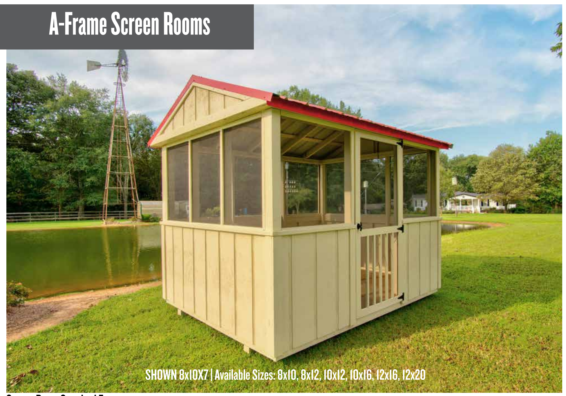
Screen Room Standard Features - Metal or Treated Siding with Sprayed on Stain - Metal Roof - One Door - Ground Contact Treated Skids