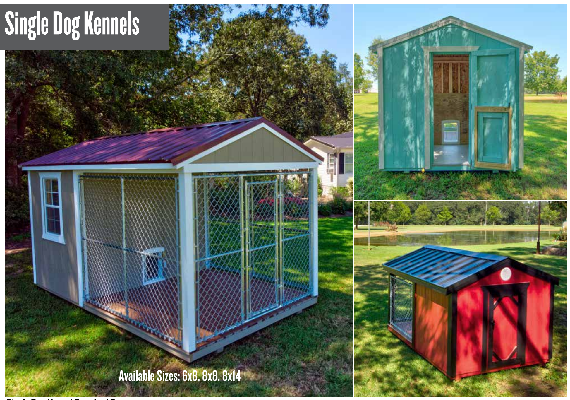
Single Dog Kennel Standard Features = Painted or Stained or Metal Siding = Metal Roof = Concealed Fasteners on Composite Flooring = Insulated Roof = Dog Door = Composite Flooring in Chain Link Area = Wire Protection on Windows = All Welded Hinges on Chain Link Doors = Ground Contact Treated Skids = FRP Floor on Interior Room