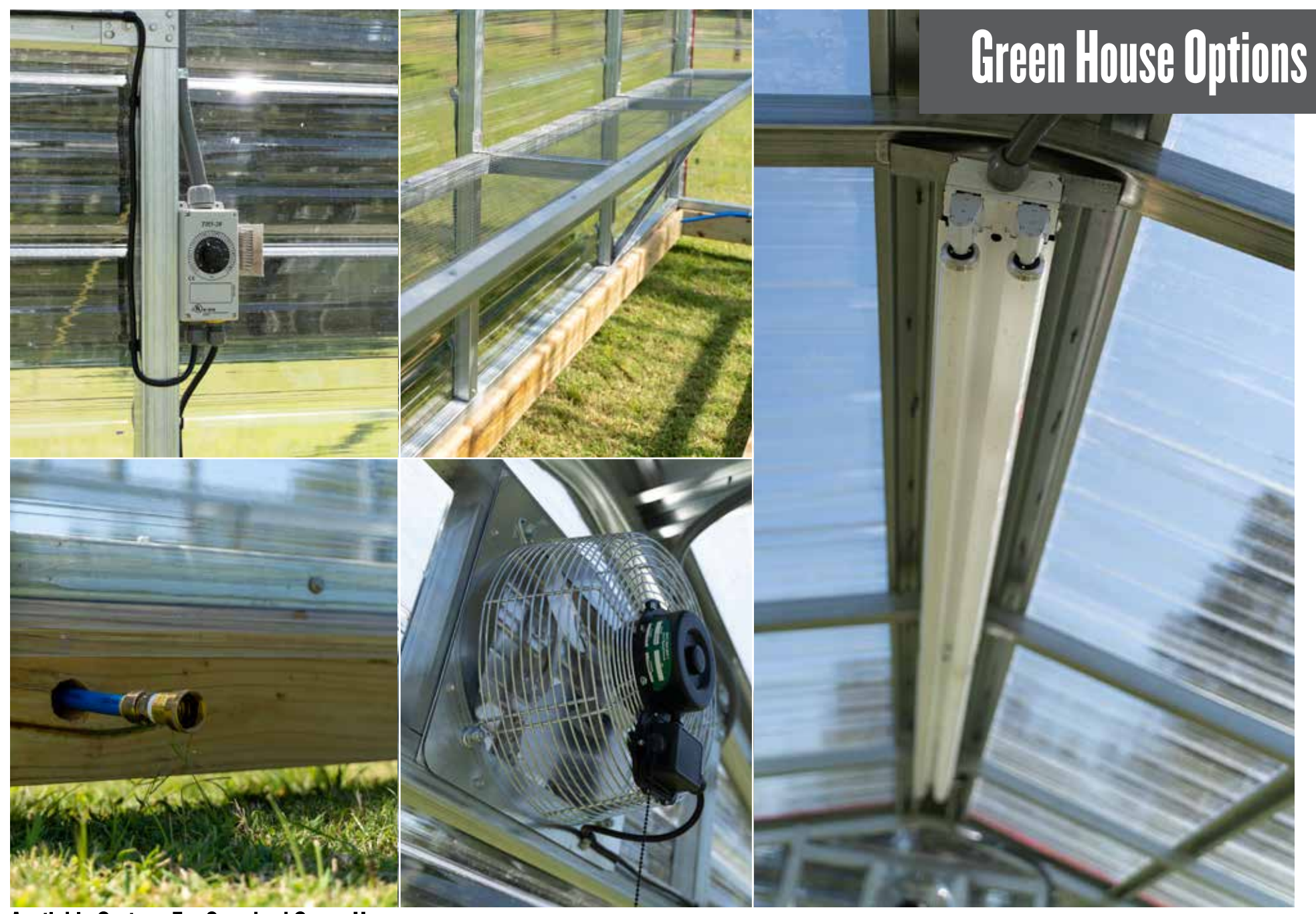
Available Options For Standard Green Houses - Window, Closures - 1 Light w/ Receptacle & Switch - 2 Lights w/ Receptacle & Switch - Extra Shelving - Heater

■ Removable Door Skirt Board ■ Louvered Fan w/ Power Shutter & Thermostat