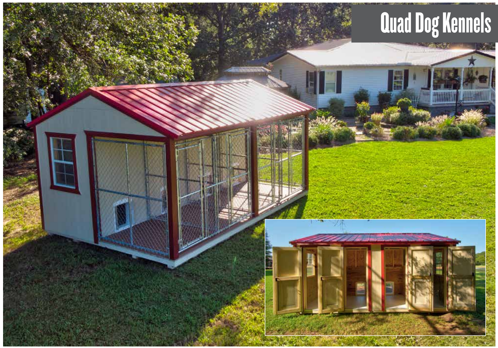
12X16 Quad Kennel Standard Features = Painted or Stained or Metal Siding = Metal Roof = Concealed Fasteners on Composite Flooring = Insulated Roof = 2 Windows = Dog Door = Composite Flooring in Chain Link Area = Wire Protection on Windows = All Welded Hinges on Chain Link Doors = Ground Contact Treated Skids = FRP Floor on Interior Room