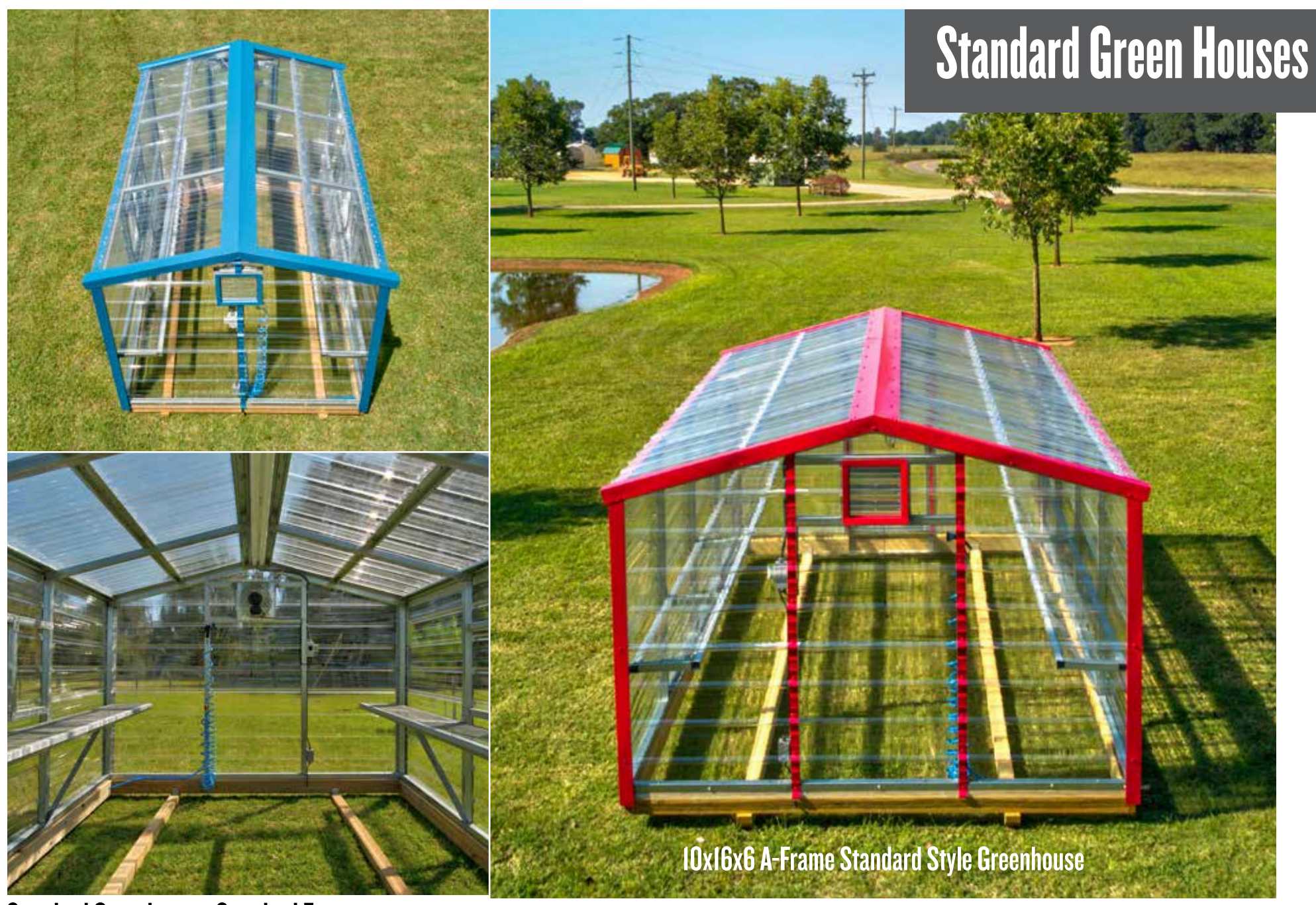
Standard Greenhouses Standard Features - Choice of Metal Trim Color - One Door - Double 2x6 Ground Contact Treated Wood Bottom Perimeter - Two 16" Shelves