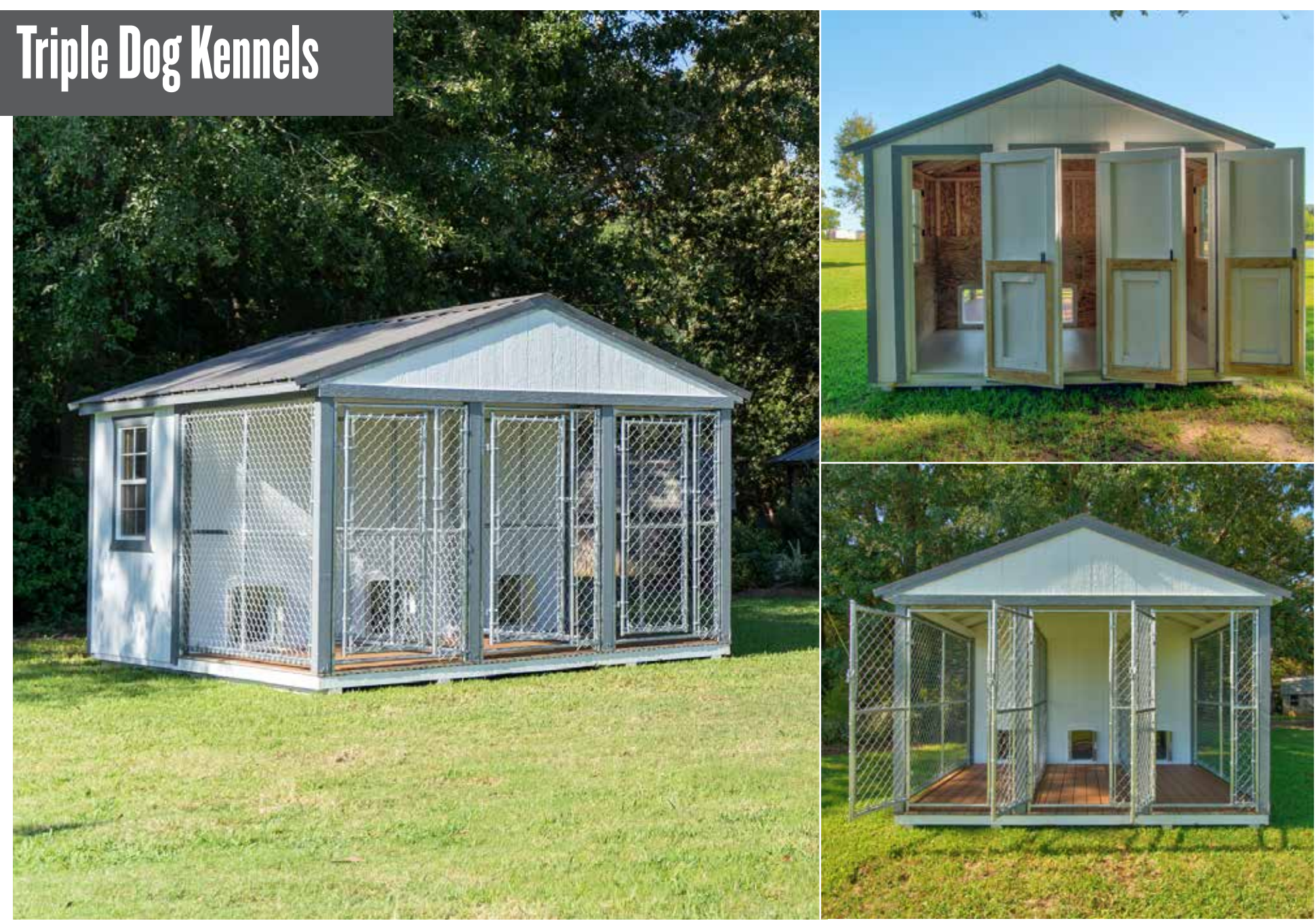
12x14 Triple Dog Kennel Standard Features = Painted or Stained or Metal Siding = Metal Roof = Concealed Fasteners on Composite Flooring = Insulated Roof = 2 Windows = Dog Door = Composite Flooring in Chain Link Area = Wire Protection on Windows = All Welded Hinges on Chain Link Doors = Ground Contact Treated Skids = FRP Floor on Interior Room